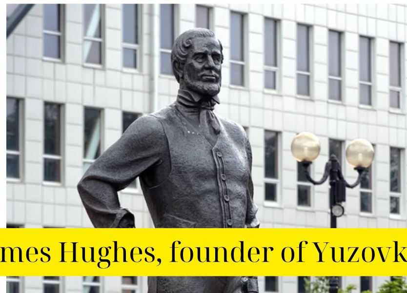
Monument to John James Hughes, founder of Yuzovka (now Donetsk), Ukraine.

John Hughes (1814-1889) was a Welsh industrialist, inventor and pioneer. More surprisingly, however, he was also the founder of the Ukrainian city of Donetsk , a man who kick-started an industrial revolution in the southern Donbass, which changed the course of history for this corner of Eastern Europe.