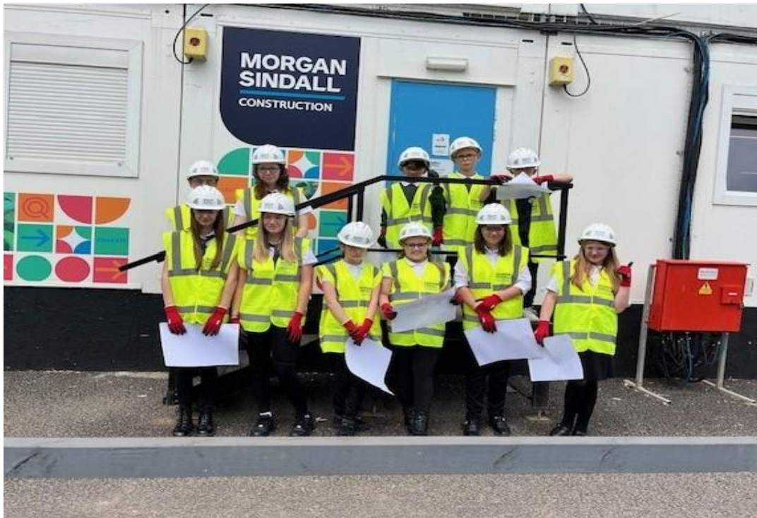
Our film making team ready to tour the new King Henry VIII 3-19 School site

A group of pupils from Years 4, 6 and 9 have been selected to make a short film about their new school. They say their aim is 'to create a film that excites and informs all their fellow pupils in the opportunities presented by our new school'. So far, they have attended three masterclasses, the first two run by Morgan Sindall gave them the opportunity to meet with some of the building managers, to examine plans and to visit the new school site. The third workshop run by experts from Monmouthshire's Communications Team helped them create story boards, write scripts and even practice filming and speaking to camera...without laughing!! We look forward to the final film being ready for distribution early in the next school year.